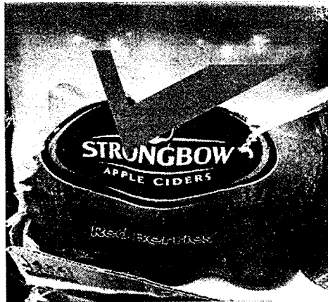
Pic 2: Correct Shrink

Please note that the incident poses no food safety risk to the consumer but can impact the ability of customers to scan and therefore sell the product due to the barcode that reflects on the Mozambique shrink wrap.