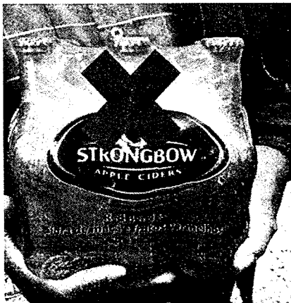
Pic 1: Incorrect Shrink

This is due to an incorrect packaging material, where the shrink wrap used was the Mozambique export shrink wrap as opposed to the local market shrink wrap as shown below.