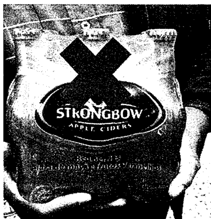
Pic 1: Incorrect Shrink

This is due to an incorrect packaging material, where the shrink wrap used was the Mozambique export shrink wrap as opposed to the local market shrink wrap as shown below.