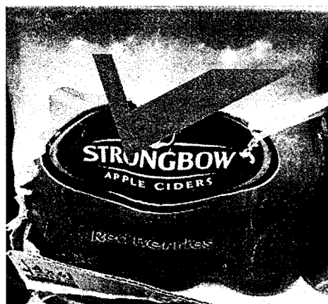
Pic 2: Correct Shrink

Please note that the incident poses no food safety risk to the consumer but can impact the ability of customers to scan and therefore sell the product due to the barcode that reflects on the Mozambique shrink wrap.