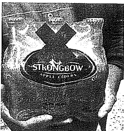
Pic 1: Incorrect Shrink

This is due to an incorrect packaging material, where the shrink wrap used was the Mozambique export shrink wrap as opposed to the local market shrink wrap as shown below.