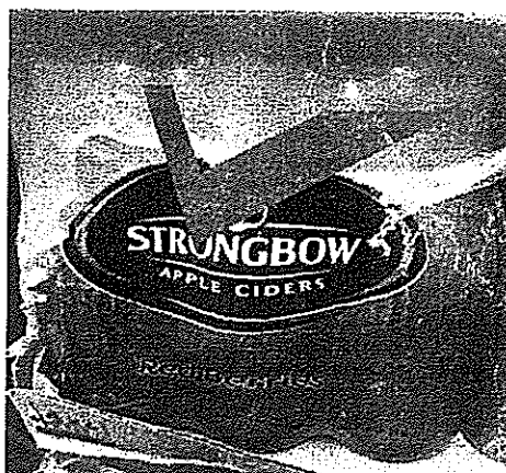
Pic 2: Correct Shrink

Please note that the incident poses no food safety risk to the consumer but can impact the ability of customers to scan and therefore sell the product due to the barcode that reflects on the Mozambique shrink wrap.