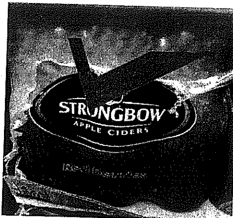
Pic 2: Correct Shrink

Please note that the incident poses no food safety risk to the consumer but can impact the ability of customers to scan and therefore sell the product due to the barcode that reflects on the Mozambique shrink wrap.