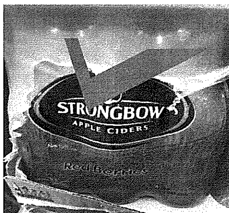
Pic 2: Correct Shrink

Please note that the incident poses no food safety risk to the consumer but can impact the ability of customers to scan and therefore sell the product due to the barcode that reflects on the Mozambique shrink wrap.