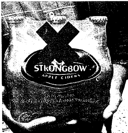
Pic 1: Incorrect Shrink

This is due to an incorrect packaging material, where the shrink wrap used was the Mozambique export shrink wrap as opposed to the local market shrink wrap as shown below.