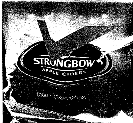
Pic 2: Correct Shrink

Please note that the incident poses no food safety risk to the consumer but can impact the ability of customers to scan and therefore sell the product due to the barcode that reflects on the Mozambique shrink wrap.