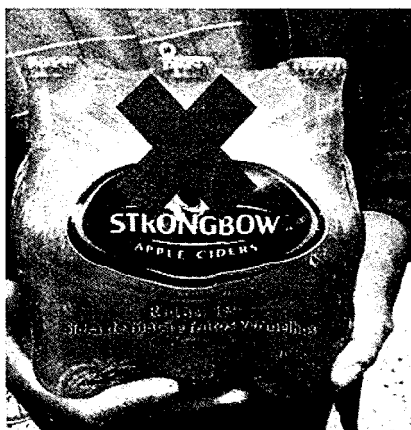
Pic 1: Incorrect Shrink

This is due to an incorrect packaging material, where the shrink wrap used was the Mozambique export shrink wrap as opposed to the local market shrink wrap as shown below.