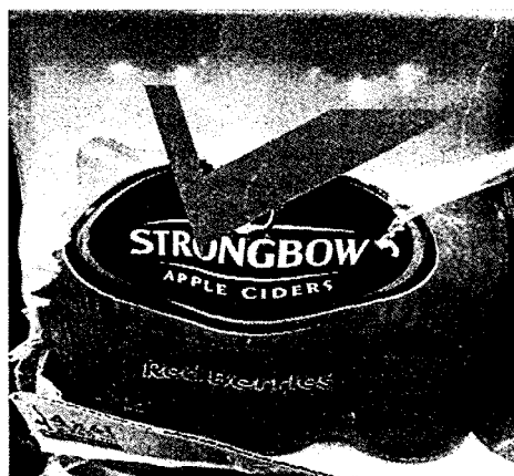
Pic 2: Correct Shrink

Please note that the incident poses no food safety risk to the consumer but can impact the ability of customers to scan and therefore sell the product due to the barcode that reflects on the Mozambique shrink wrap.