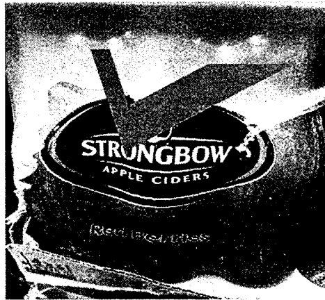
Pic 2: Correct Shrink

Please note that the incident poses no food safety risk to the consumer but can impact the ability of customers to scan and therefore sell the product due to the barcode that reflects on the Mozambique shrink wrap.