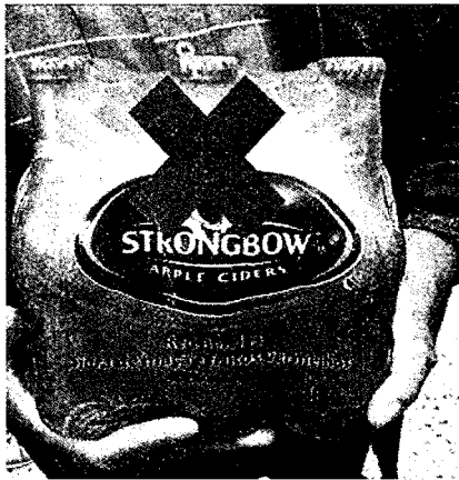
Pic 1: Incorrect Shrink

This is due to an incorrect packaging material, where the shrink wrap used was the Mozambique export shrink wrap as opposed to the local market shrink wrap as shown below.